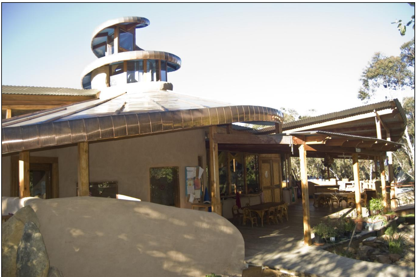
The Kindlehill Kindy Garden

The College reports to the Board, and reports on behalf of the Board. These are the key school bodies.