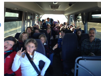
Class 5-6 on the way to the snow